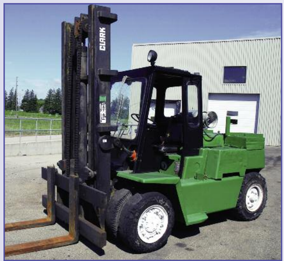
CLARK 15,000 LB CAPACITY, MODEL C500Y150