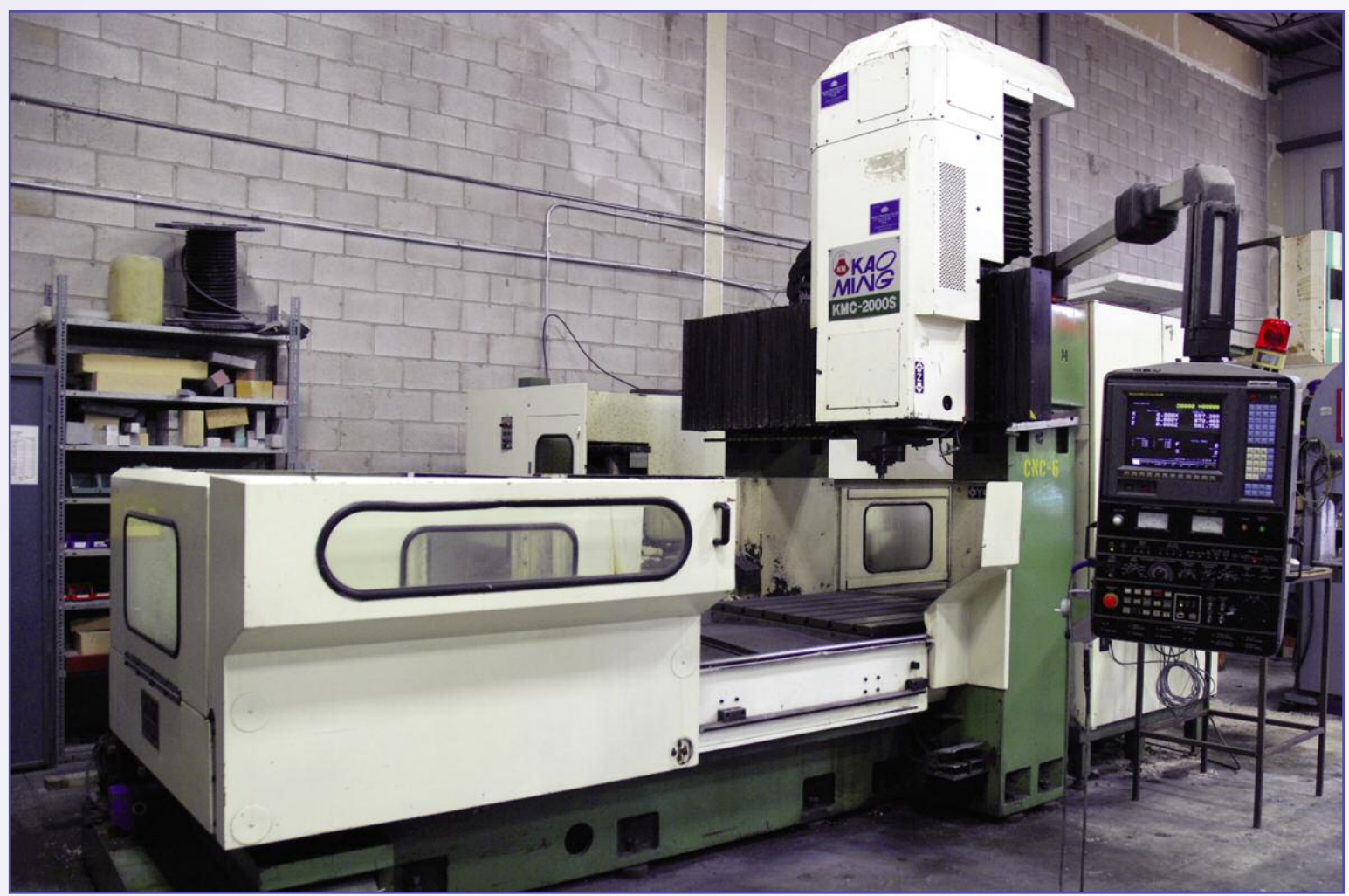
KAO MING KMC 2000S CNC VERTICAL GANTRY MILL