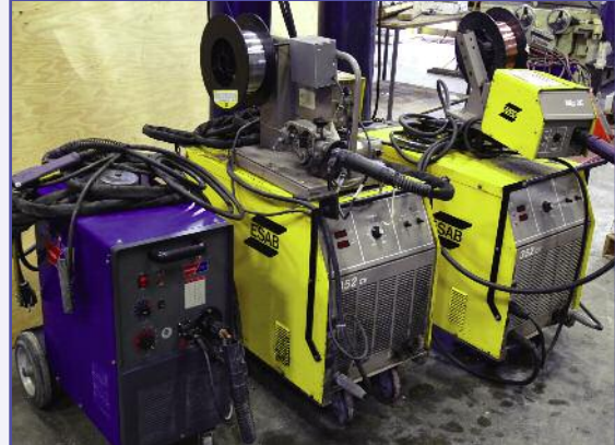
PARTIAL VIEW OF WELDERS

COLCHESTER ENGINE LATHE, MODEL MASCOT 1600