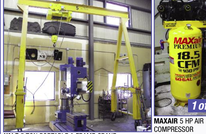
YALE 5 TON PORTABLE A FRAME CRANE