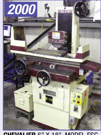
CHEVALIER 6" X 18", MODEL FSG 618M HYD. SURFACE GRINDER

PROXY BIDDING: We will be happy to bid on your behalf if you are unable to attend our auction. Please call our office at 1-866-669-8893, or visit infinityassets.com to submit a proxy bid.