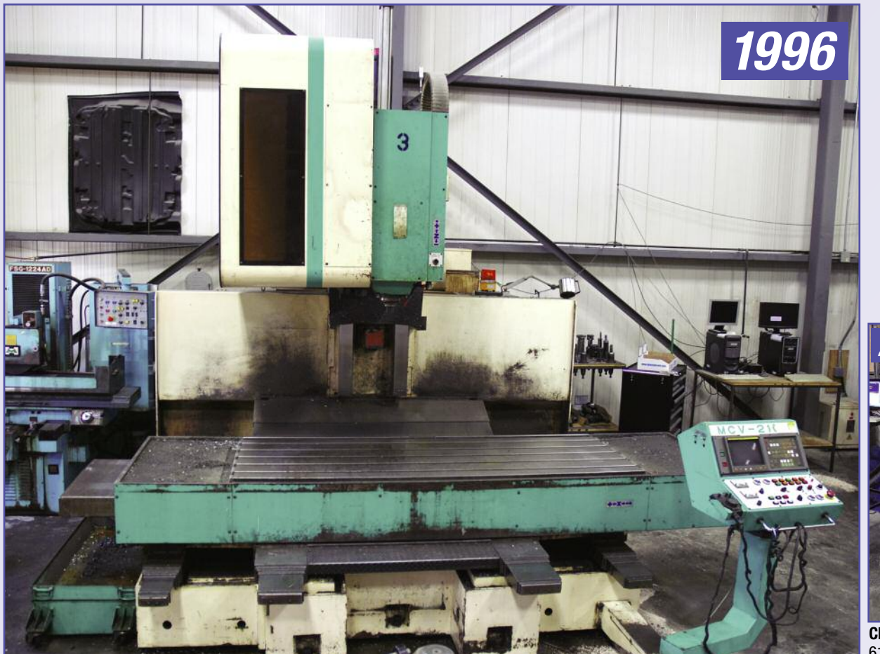
DAHLIH MODEL DL MCV2100 CNC VERTICAL MACHINING CENTER